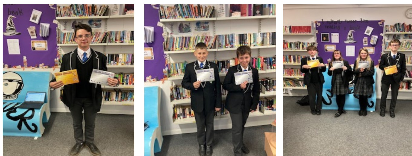
Here is our latest crop of KS3 bronze, silver and gold Reading Award winners. They have all done exceptionally well with their reading this half-term!